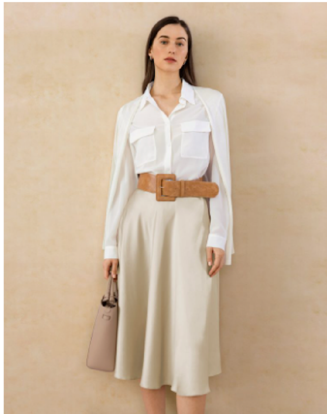
The Valerie Skirt

A versatile piece that's anything but basic, the Valerie Skirt is an elegant addition to any capsule wardrobe. Soft silk charmeuse flows beautifully, while the creamy color adds a touch of romance no matter how you style it. An oversized hemline on this umbrella skirt is flattering and comfortable, giving you more reasons to reach for this silhouette again and again. Daytime styling is made simple with a basic white tee and espadrilles, front-tucked knitwear and a coat for cooler weather, or paired with a strappy silk camisole and heels for an evening out.