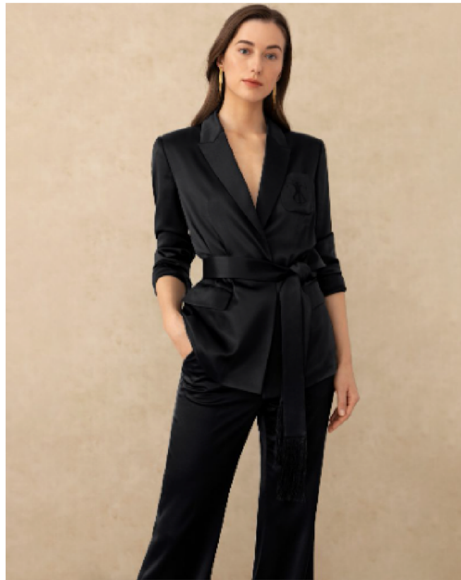
The Alpina Blazer

Looking for a transitional fall top that moves flawlessly between smart workwear and weekend meetups with friends? Say hello to the 'shacket' (shirt + jacket). Our Myrtus Jacket blends the classic style of military-inspired fashion (take note of the functional pockets and a buckled belt at the waist) with the tailored softness of silk charmeuse. Layer the Myrtus Jacket with knitwear for brisk fall outings, or wear open over a sleek slip dress for a look that's easy-to-wear and instantly chic.