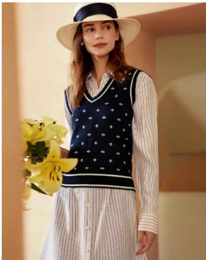
Silk Knit Anemeno Vest

When it comes to comfortable workleisure, smart layering is key. We love our silk Anemeno vest 8285 as a fresh update to your existing office attire. Bring new life to your well-loved blouses by layering them under this perfectly preppy vest inspired by the classic men's pullover. Influenced by art deco flair, the argyle patterns, rhomb patterns, and contrasting ribbed edges add poise and personality, while the uber-soft blend of silky yarn ensures you'll stay cozy throughout the day. An ideal companion for cooler spring days, leave your jacket at home and instead style the Anemeno vest over a chic long-sleeved silk shirtdress during a lunchtime outing with coworkers, after-work happy hour, (or as an added layer of warmth when the in-office AC is set just a touch too chilly!)