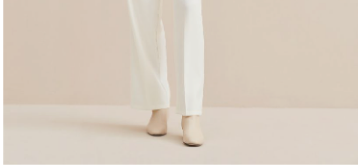
The Cervina Blouse

Holiday celebration with friends and family on the calendar? Opt for a luxe pullover like our Cervina Blouse 9876 for an easy-to-wear style that's effortlessly elegant and oh-so comfortable. We love this look for the stretch double georgette fabric crafted from 90% silk and 10% spandex, giving it added elasticity, wrinkle-resistance and draping, so you can look as good as you feel. We envision this retro-inspired blouse with trousers in light neutral tones and a pretty necklace that lets the v-neckline shine. To add cozy appeal, drape your favorite chunky knitwear over your shoulders for a practical and polished holiday ensemble that exudes off-duty elegance.