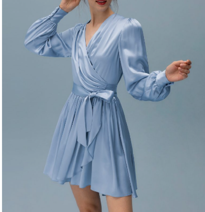
The Linaria Wrap Dress

There is something incredibly romantic and feminine about a classic silk wrap dress. Between the tie waist, gently puffed sleeves and pleated skirt practically made for twirling beneath holiday lights, the Linaria Wrap Dress 9872 is a pretty choice for a dreamy winter date night with your special someone (don't forget the mistletoe!). Select the sky-blue color for a soft winter look that will carry you into spring and beyond, or opt for navy for a timeless outfit you can transition from workwear to eveningwear with the simple swap of a statement heel and handbag.