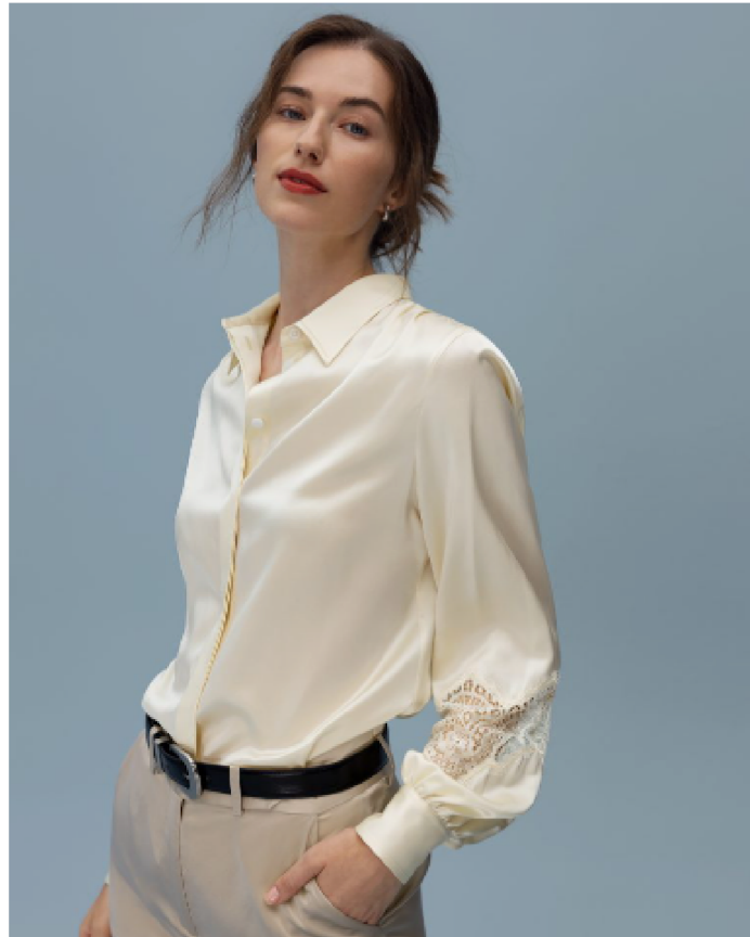
The Armeria Lace Blouse

A timeless combination of silk and lace, the Armeria Lace Blouse 9875 is a classic piece that you'll reach for season after season. We love this look for a posh end-of-year office soiree, where the glossy sheen of the 22 momme charmeuse silk feels festive and easily transitions from daytime to evening when paired with wide leg trousers or a silk skirt. Lace detailing on the sleeves, mother of pearl buttons and a concealed placket give this sweet blouse a subtle vintage vibe, while the creamy lily white color is perfect for pairing with your winter whites.