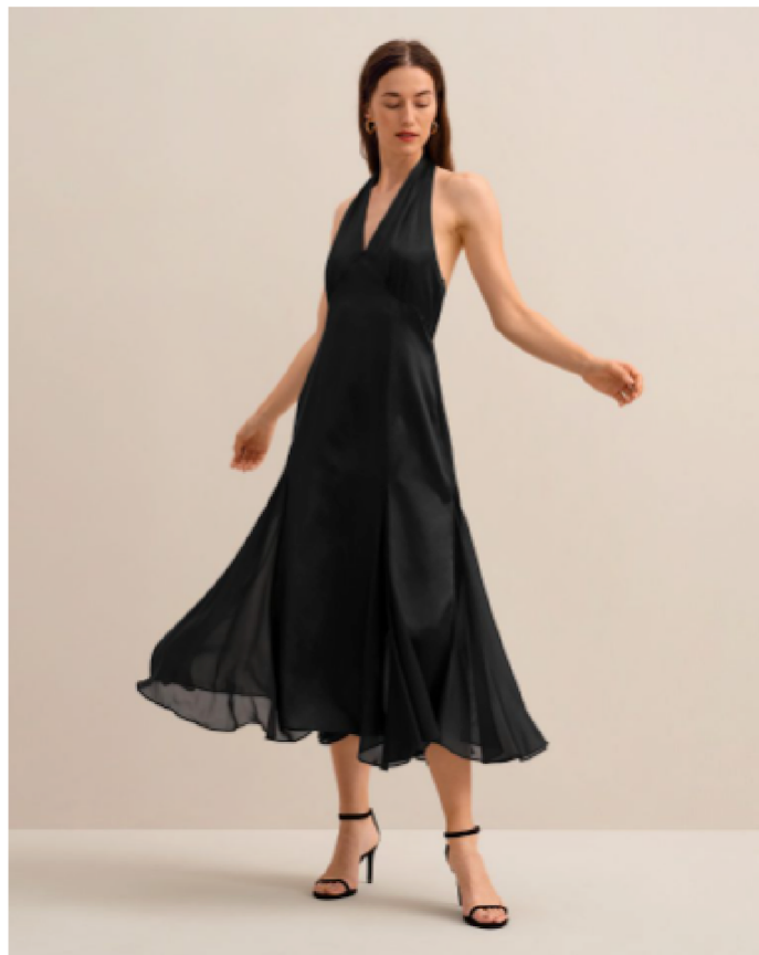
The Aster Dress

Whether hosting or toasting, capture the attention of everyone in the room in a spotlight-worthy silk halter gown. Our Aster Dress 9873 dials up the drama with an open back and