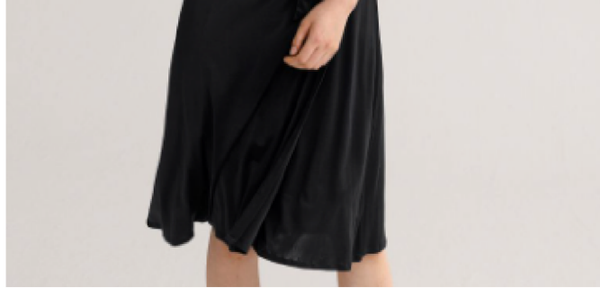
Silk-Knitted Armeria Dress