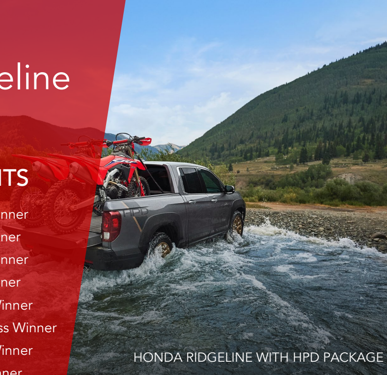
HONDA RIDGELINE WITH HPD PACKAGE