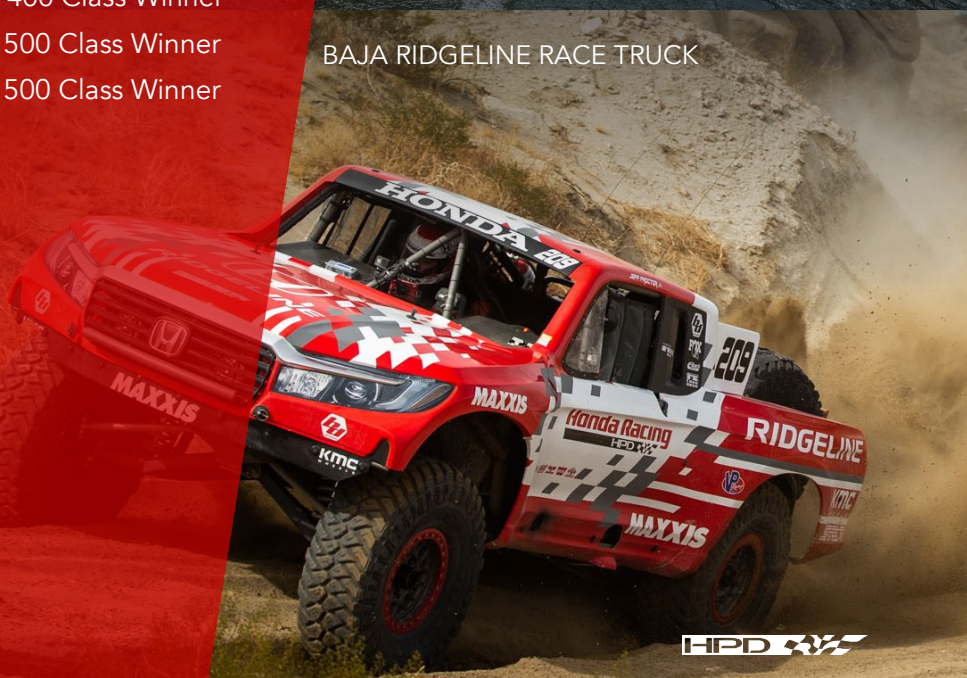
BAJA RIDGELINE RACE TRUCK